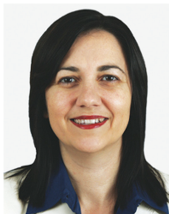
Annastacia Palaszczuk, Queensland Minister for Disability Services and Multicultural Affairs

When she was diagnosed she went straight to the MD Foundation website to find out more information and learn about what was happening to her eyes.