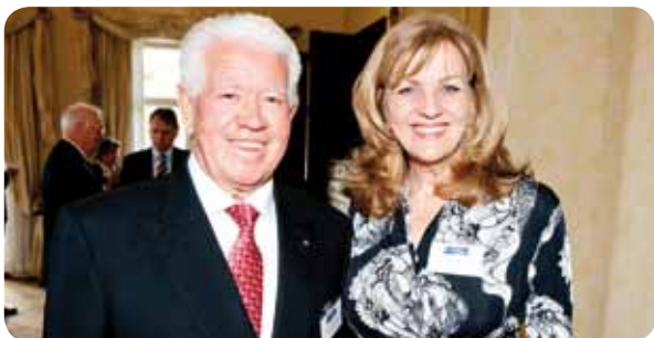
Marcus Blackmore and Jean Kittson